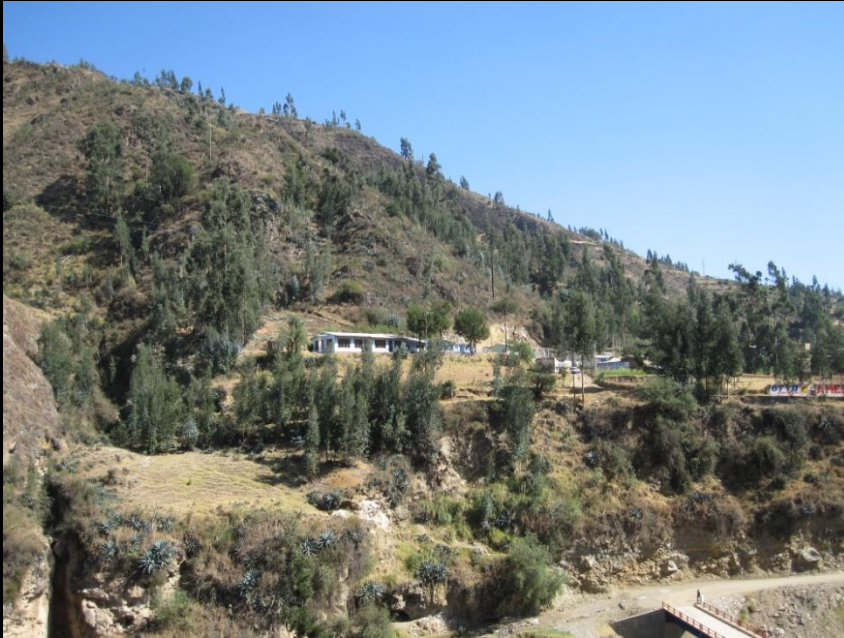
Rural school #1